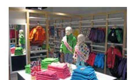
Email loyal customers when new items matching their profile hit the store.

communications related to can personalize customers'